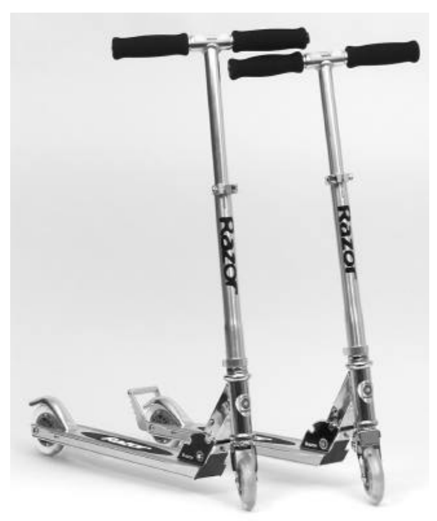
Applies to Every Razor A-type Kick Scooter